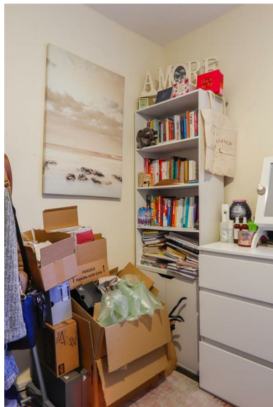
Brook Street, Barry, CF63 4PT